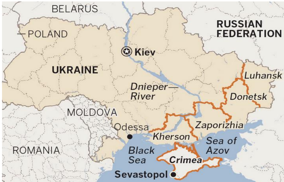
Figure 1: Land Border Conflict between Russia and Ukraine